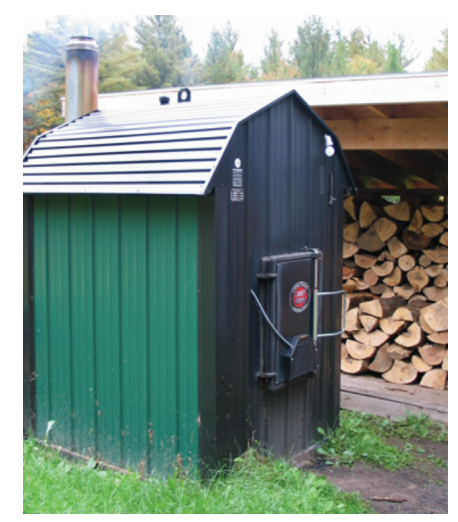
Outdoor wood burner

Unqualified heaters can be substantially dirtier and less efficient than other wood burning appliances. Inadequate combustion technology causes cool, smoldering fires that emit substantial amounts of smoke. The short stack of many heaters also emits smoke close to the ground, where it tends to linger. In communities where these units have become